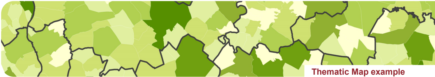
Thematic Map example